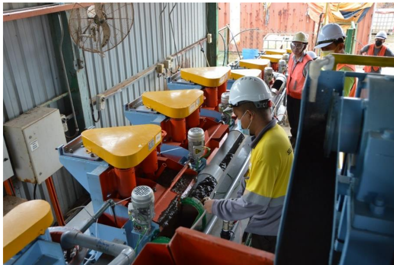
Figure 3: Flotation Pilot Plant

The completed pilot plant comprises ball mill and classifier, rougher / scavenger flotation cells and three stages of cleaner flotation. (Figure 3). A one tonne sample of transition ore was crushed in the laboratory fine jaw crusher to 100% passing 2mm to provide feed for the pilot plant ball mill. The sample was processed using the same reagent regime planned for the full-scale plant. A total of 50kg of flotation concentrate was produced and a sample of this was sent to McLanahan for filter press testwork. Antimony leaching tests were conducted to support gold concentrates marketing efforts.