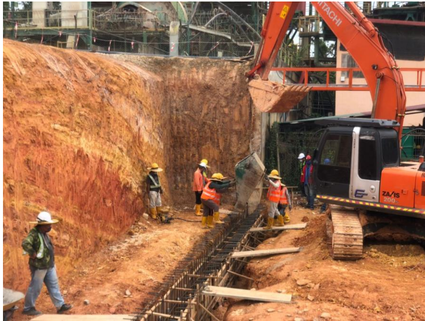
Figure 4: First Concrete Pour at Flotation Foundation

Other contractors working on the construction site have: rerouted the HV power cables to the primary and secondary ball mills, connected power and communications cables to the project office, carried out plate bearing tests over the plant footprint, and tested soil resistivity for the new transformer.