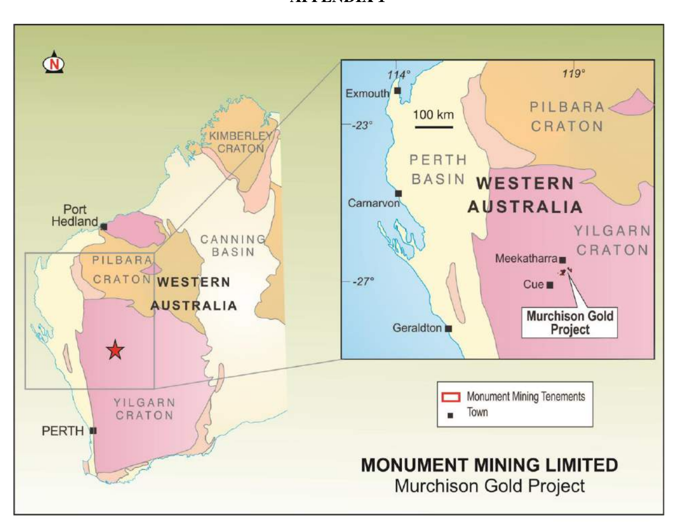
Figure 1 – Murchison Gold Project