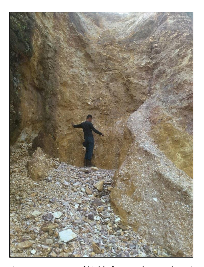
Figure 2. Exposure of highly fractured quartz breccia in the existing pit wall.

The Pahang State Mineral and Geoscience Department has given approval to proceed with the bulk sampling program. Previous mining activities in the early nineties were carried out by local miners who left behind several small mining ponds and a minor amount of tailings and historical ore stockpiles (Figure 2). The mining lease was granted at Peranggih, and it has been registered on 15<sup>th</sup> March 2019 and valid for 10 years till 14<sup>th</sup> March 2029.